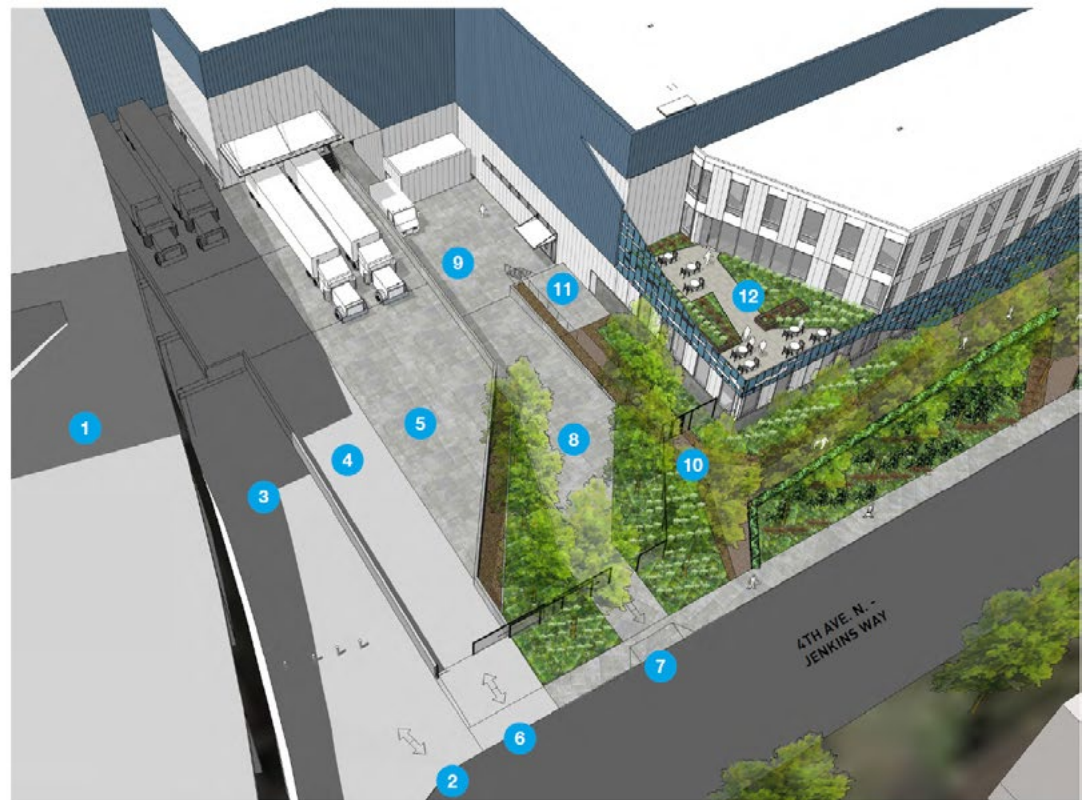
Figure 2: Loading and service area for existing McCaw Hall and the proposed expansion